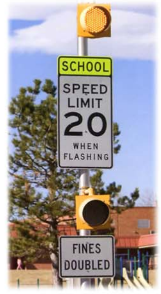
Top and Bottom Display

We Accept Purchase Orders from School Districts and Municipalities Please see our section 'accepting purchase orders' for more details.