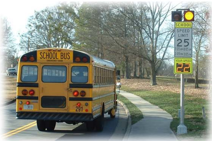
Two flasher display options available Side-by-side and Top and bottom mount